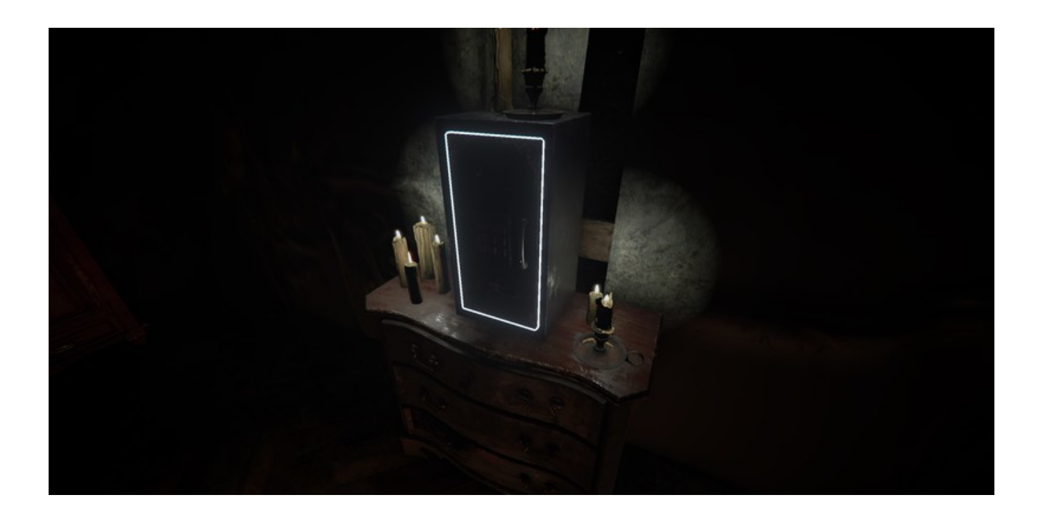
Download ->->-> http://bit.ly/2JnffRu